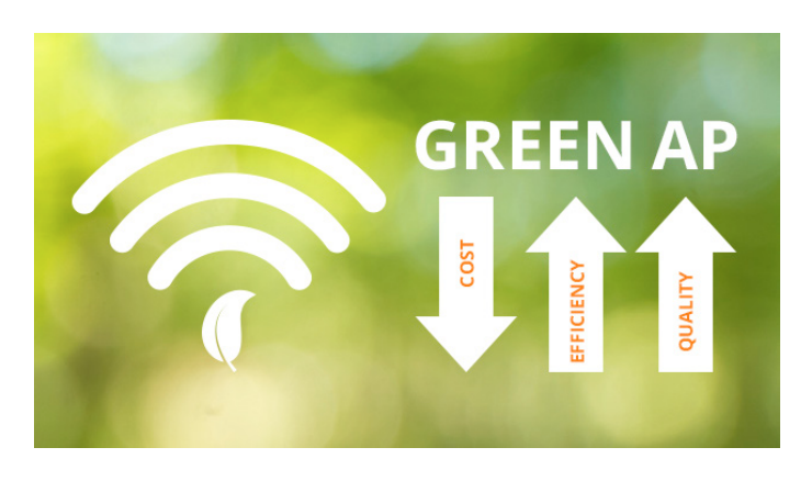
Green AP mode can result in power savings of more than 70%