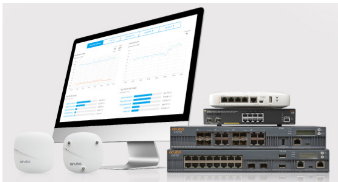
Aruba combines best-in-class wireless and wired infrastructure and management orchestration features with cost saving SD-WAN capabilities.

Zero Touch Provisioning (ZTP) offers IT the ability to quickly and accurately configure and deploy all access infrastructure within a branch. A simple to deploy mobile app allows any non-technical employee to barcode scan an Aruba access point, switch, or SD-Branch Gateway and bring devices up, for reduced deployment timelines.